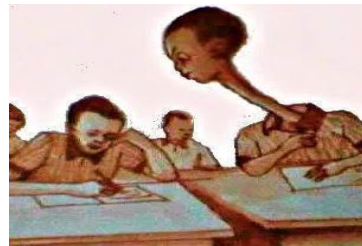
Giraffing is strictly prohibited in this test!